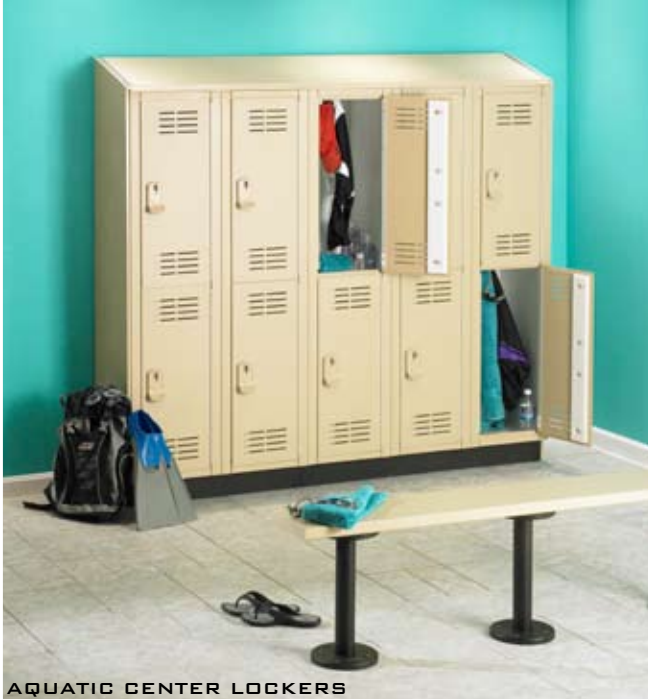
AQUATIC CENTER LOCKERS